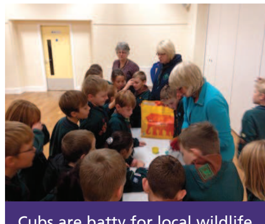
Cubs are batty for local wildlife

Cubs loved the visit to the Gujarat Temple in Preston, we took part in one of their evening prayer sessions, learnt about the different gods, and sampled the food offerings, if you haven't been, it's well worth a visit, it's beautiful.