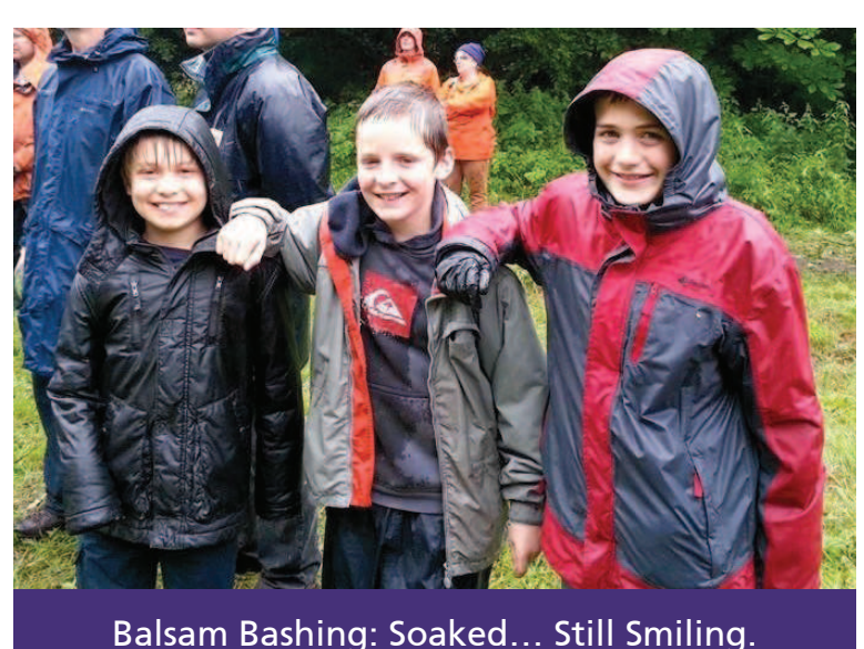
Balsam Bashing: Soaked... Still Smiling.

8th February 8th March 10th May 14th June 12th July