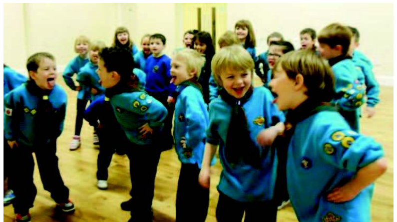
The Beavers practicing the haka.

27th April St George's Parade, Guild Hall 11th May Church Parade, FMC 12th May Beetle Drive, FMC 8th June Church Parade, FMC 13th July Church Parade, FMC