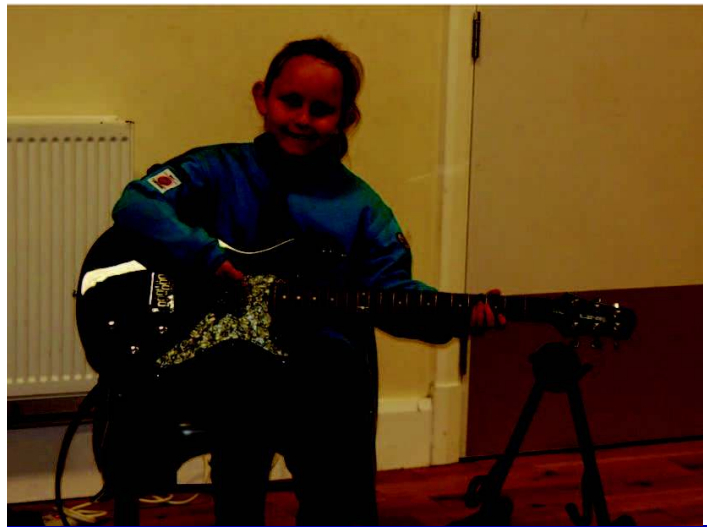
This one goes up to eleven!