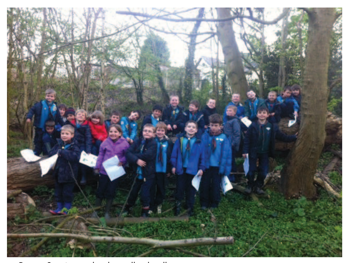
Beaver Scouts on a local woodland walk